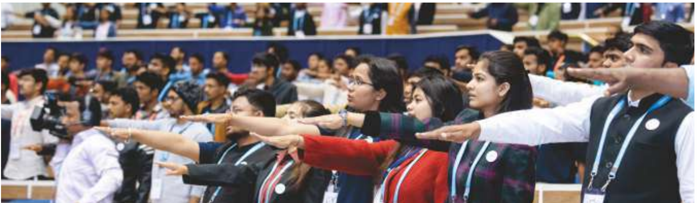
The sequence of above photographs is randomly arranged.