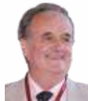
Mark Tully Former Bureau Chief, BBC, India