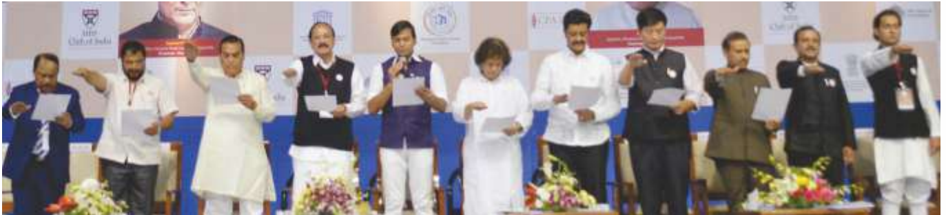
M. Venkaiah Naidu and Zakir Hussain Administering Oath of "Swachh Bharat" at 6 th BCS