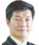
Lobsang Sangay Former President, Central Tibetan Administration, Tibet