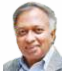
Vijay Bhatkar Eminent Computer Scientist Ex Chancellor, Nalanda University