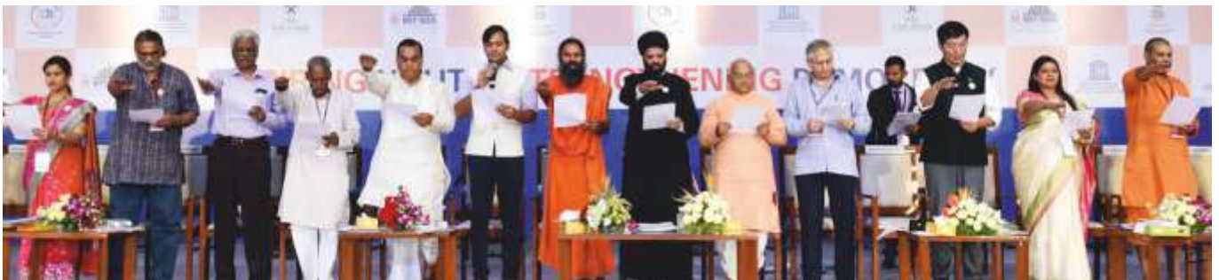
Yog Guru Swami Ramdev Administering Oath of "Strengthening Democracy" at 7 th Bharatiya Chhatra Sansad