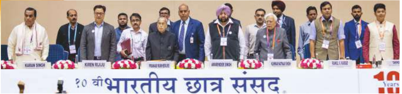
Paying respect to and reciting the National Anthem, at 10 th BCS