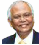
R. A. Mashelkar, FRS Reliance Innovation Leadership Centre Former Director General, Council of Scientific & Industrial Research (CSIR)