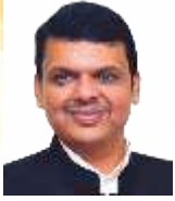
Shri. Devendra Fadnavis Hon'ble Chief Minister of Maharashtra